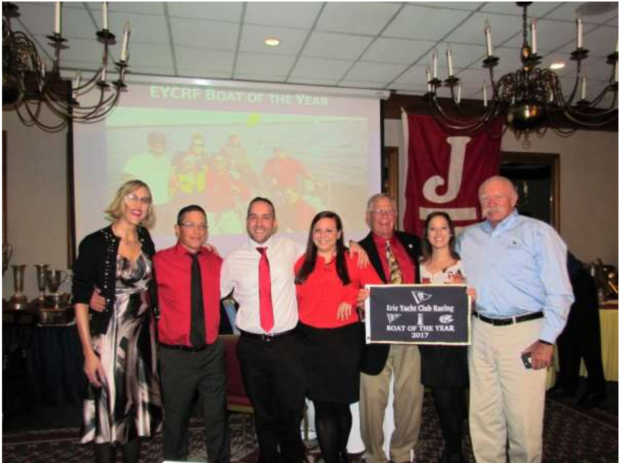
Magic 2017 Boat of the Year