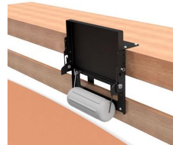
Step in storage position