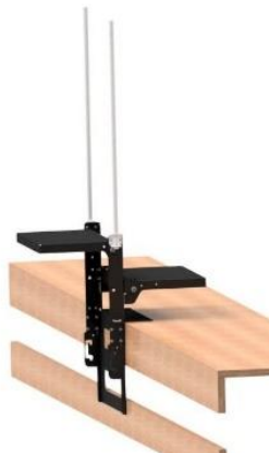
Double Step-Up with Handles