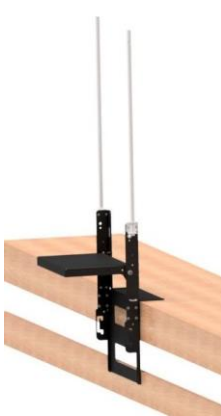
Single Step-Up with Handles