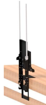
Step in storage position